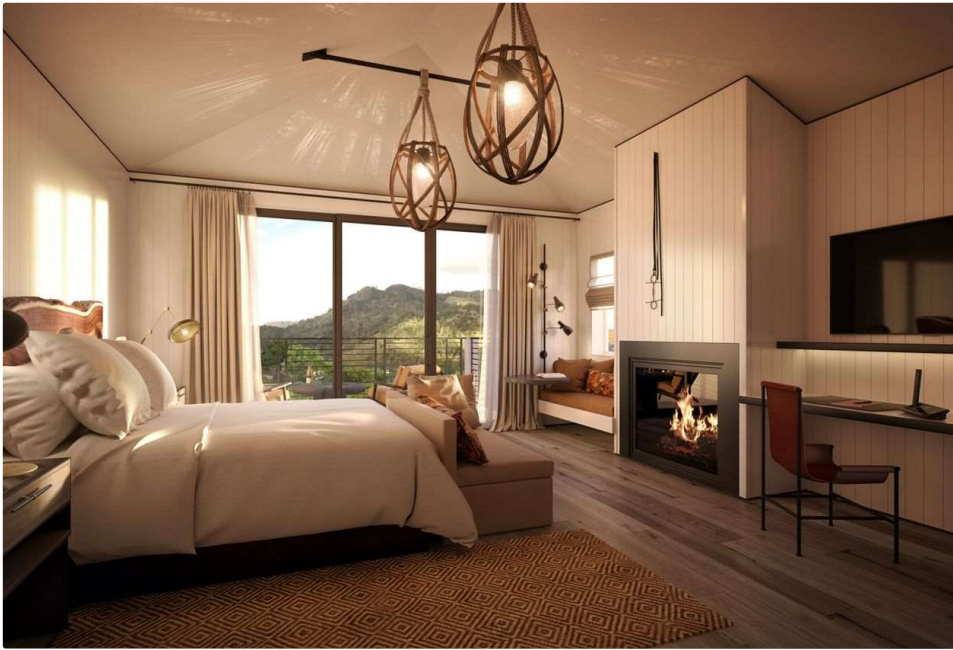
Four Seasons Resort Napa Valley. Four Seasons

Also opening mid-2021, the Four Seasons New Orleans is poised to be a dining destination. James Beard award-winning Louisiana chefs Alon Shaya and Donald Link will head the food and beverage outlets at the 341-room high-rise, the first luxury hotel to hit the Crescent City in two decades. An impressive art collection will represent local talent and tell the story of New Orleans.