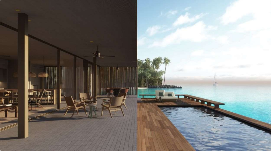
A water villa at Patina Maldives, Fari Island. Patina Hotels & Resorts