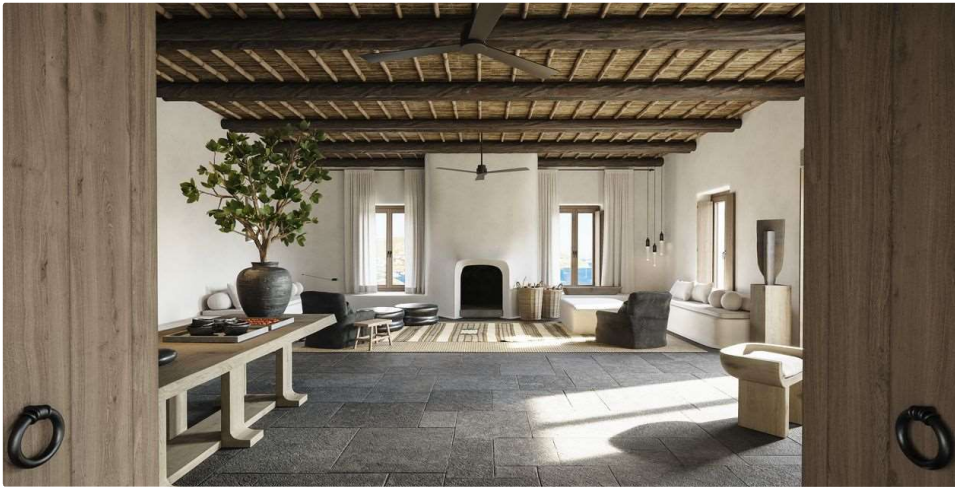
The lounge area at Kalesma Mykonos.