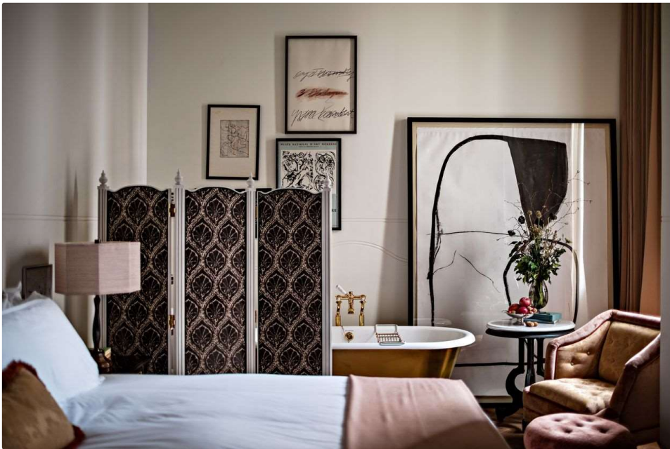
NoMad London. NoMad

A skip across the Atlantic, NoMad Hotels is launching its first property outside of the U.S. Situated in Covent Garden and close to the Royal Opera House, the 91-room NoMad London injects its brand of hip into the former magistrates’ court, a 19th-century building reconceived by New York-based design firm Roman and Williams. The U.K. outpost, scheduled to debut sometime this spring, will house the NoMad restaurant, Side Hustle Bar, The Library, and a cocktail tavern.