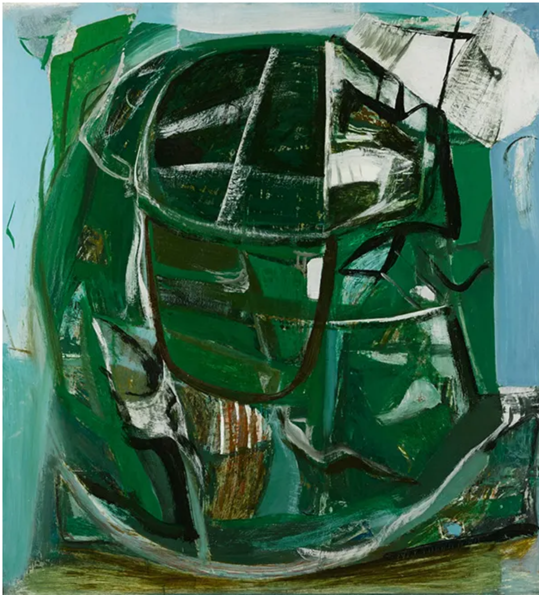
Peter Lanyon's 'Trevalgan' (1951)

Bowie's burgeoning interest in modern British art developed during a relative lull in his career in the mid-1990s, although the period did produce the acclaimed Outside album. The dystopian, experimental work featured a harrowing self-portrait on its sleeve, and was fraught with end-of-the-millennium anxiety.