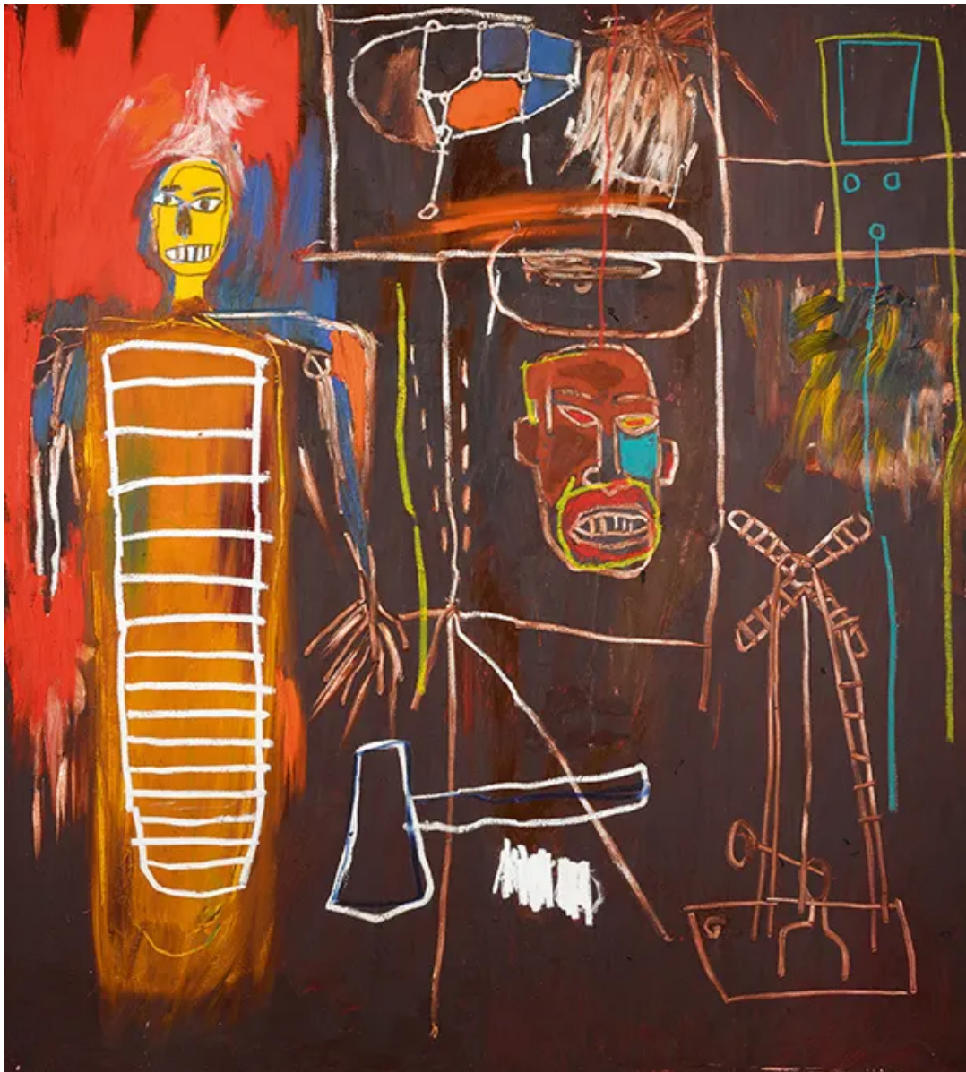
Jean-Michel Basquiat's 'Air Power' (1984)

Although he had a highly public career, the legendary musician was a quiet buyer of modern British artworks